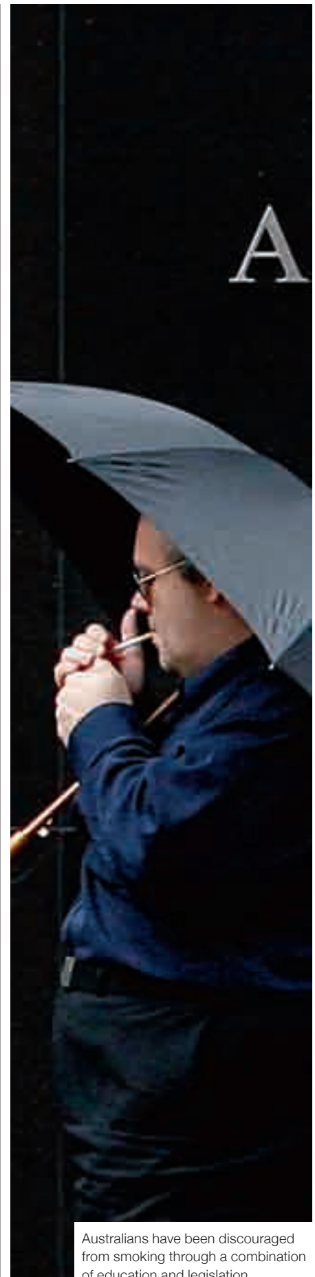
Australians have been discouraged from smoking through a combination of education and legislation

We know, as does the tobacco industry, that plain packaging will work. The industry is fighting to protect its profits, but we are fighting to protect lives. ■