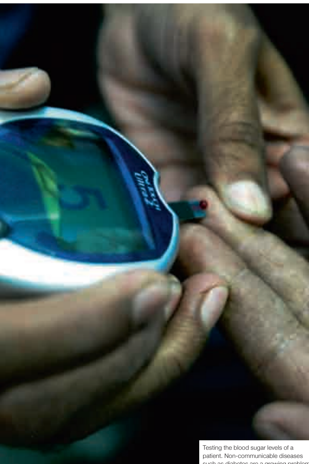
Testing the blood sugar levels of a patient. Non-communicable diseases such as diabetes are a growing problem

pharmaceutical products, SEAR is well recognised for its contribution of low-cost but quality antiretroviral drugs (ART) and vaccines against measles and meningitis to mitigate the impact of these diseases all over the world.