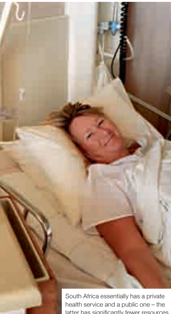
South Africa essentially has a private health service and a public one – the latter has significantly fewer resources

These interventions were initiated to reduce maternal and child mortality in particular but also to empower communities to prevent ill health and ensure the early identification of disease and early treatment.