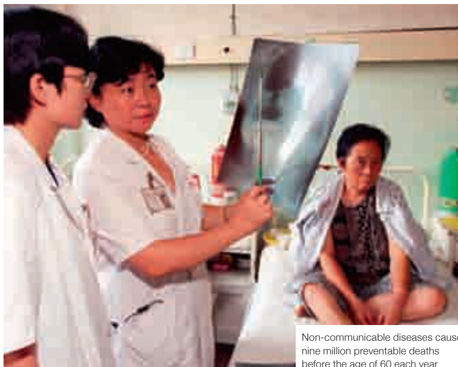
Non-communicable diseases cause nine million preventable deaths before the age of 60 each year

By the end of 2012, governments will agree upon the first ever set of global NCD targets. Every government will report against those targets to show progress and indicate change. As World Health Organization director general Margaret Chan said in April 2011, “what gets measured gets done”. For the first time, many governments will have to confront the fact that they do not know how many people have NCDs, let alone how many of those people are diagnosed and receiving treatment. This will be a major breakthrough.