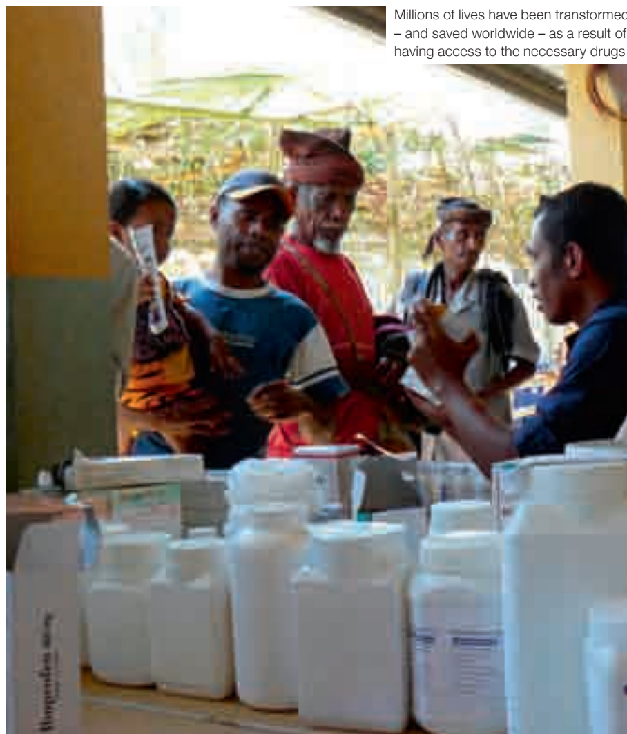
Millions of lives have been transformed – and saved worldwide – as a result of having access to the necessary drugs

Adapted, affordable drugs and diagnostics are needed. But the current model of drug development, bound up as it is with potential profits on sales, is unlikely to provide the