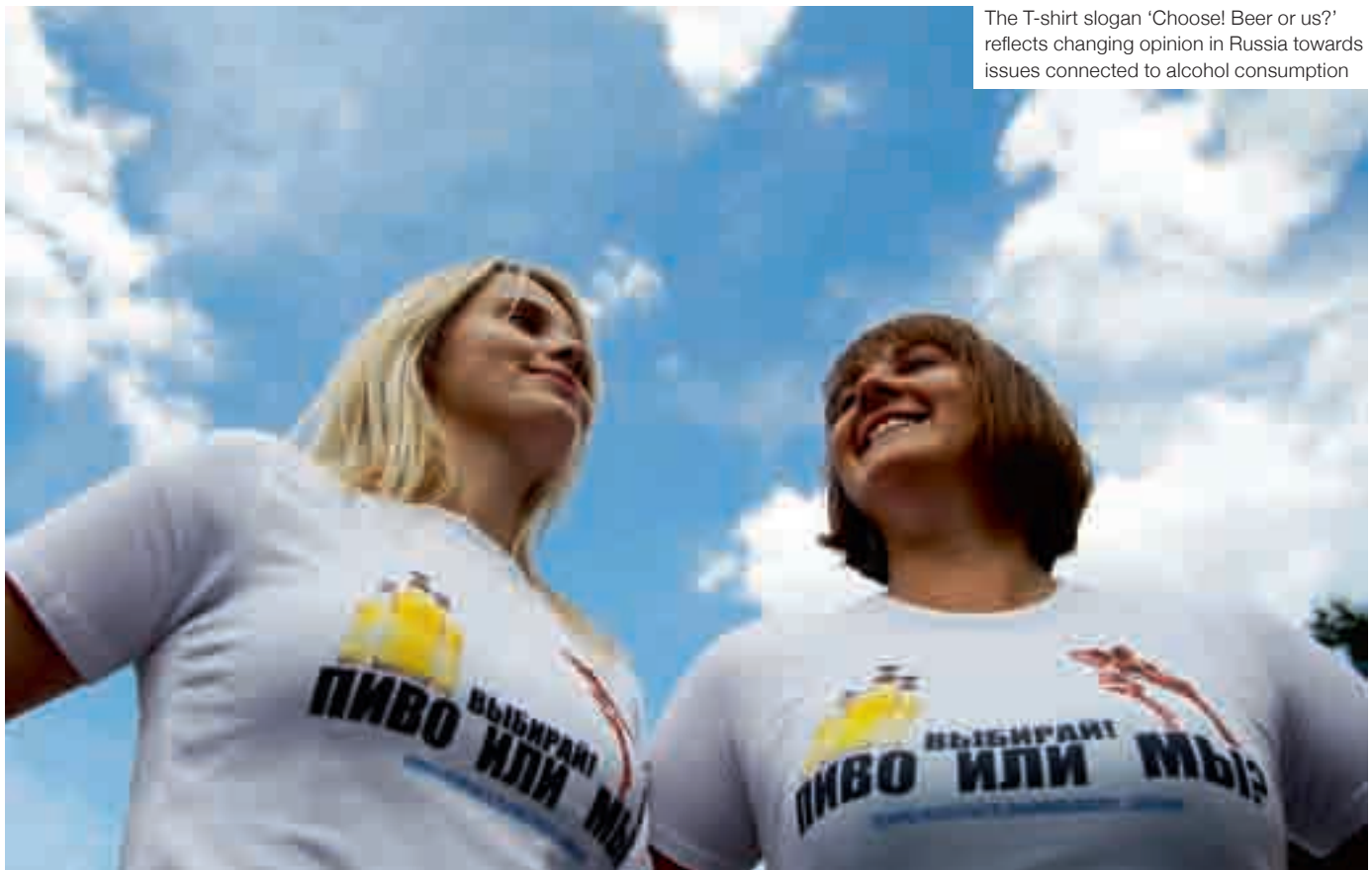
The T-shirt slogan 'Choose! Beer or us?' reflects changing opinion in Russia towards issues connected to alcohol consumption

of people receiving the necessary medical and social rehabilitation.