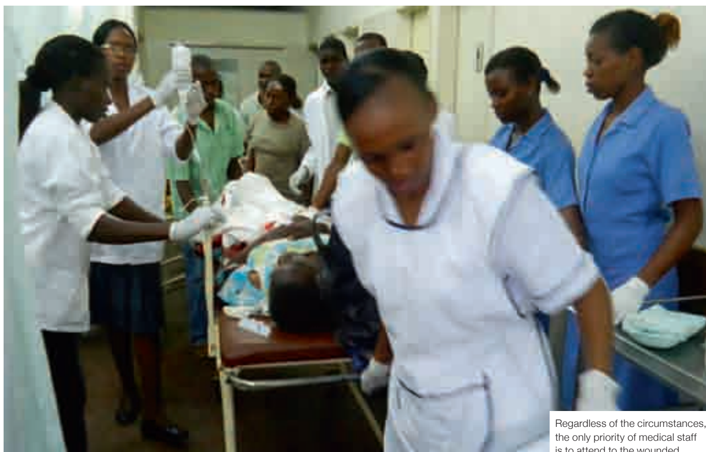
Regardless of the circumstances, the only priority of medical staff is to attend to the wounded

be spared further suffering during armed conflict and to receive timely assistance. Accordingly, healthcare facilities, personnel and transport have a protected status as long as they retain a neutral function and treat all patients equally, irrespective of political, religious or ethnic affiliation.