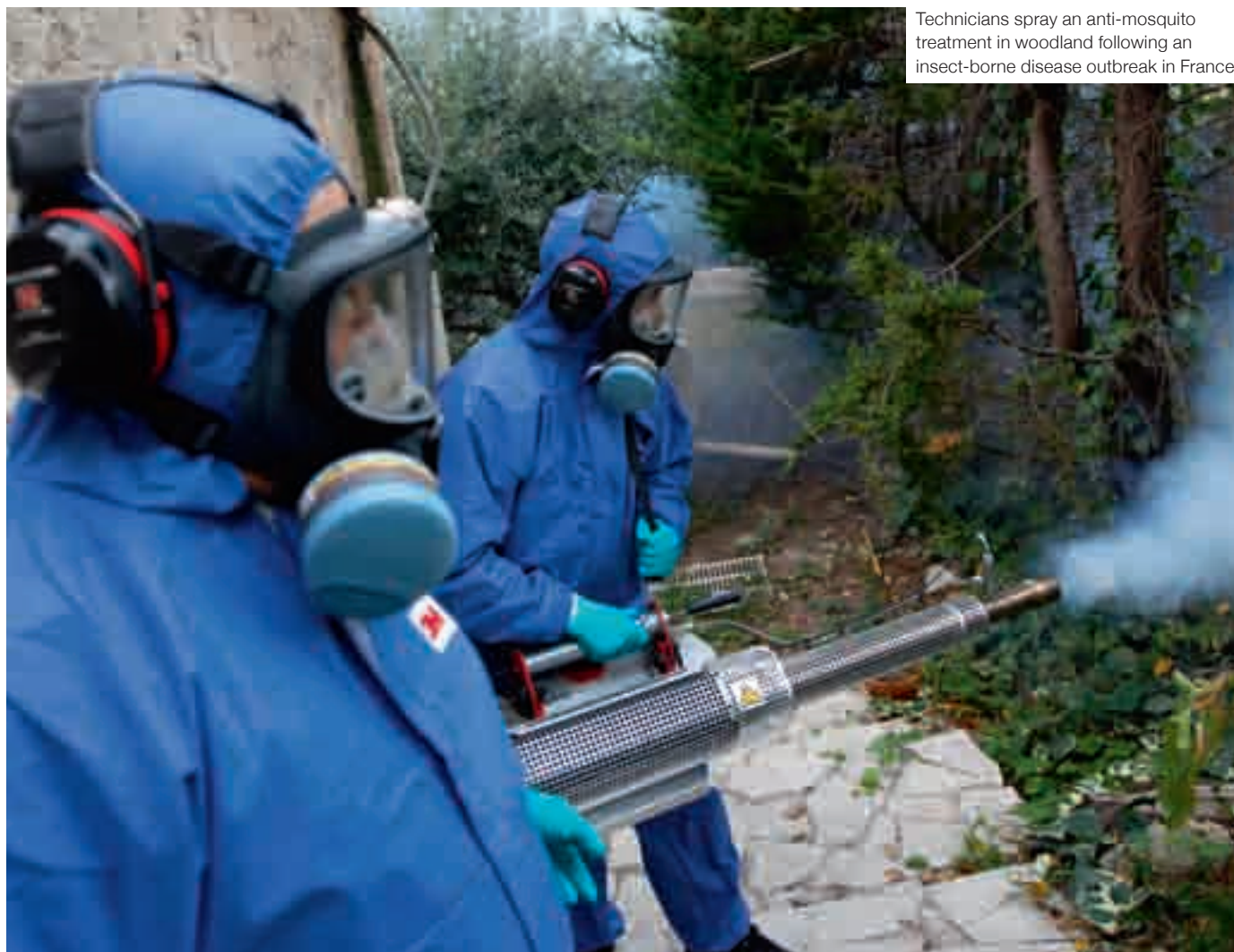
Technicians spray an anti-mosquito treatment in woodland following an insect-borne disease outbreak in France

social changes, and international travel, which drives a great movement of hosts, continue to change the profile of infectious disease occurrence, affecting pathogens across a wide taxonomic range of animals and plants’.