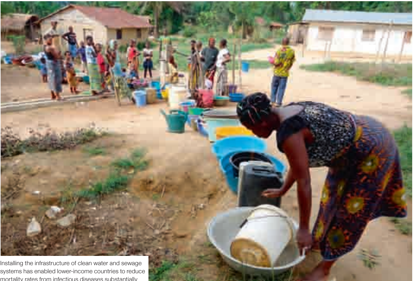
Installing the infrastructure of clean water and sewage systems has enabled lower-income countries to reduce mortality rates from infectious diseases substantially

automobile safety requirements, better road design, speed limits and mass transit infrastructure. Gun violence can be reduced by restrictive gun-permitting laws. Air pollution can be controlled through emission controls and the use of cleaner energy sources.