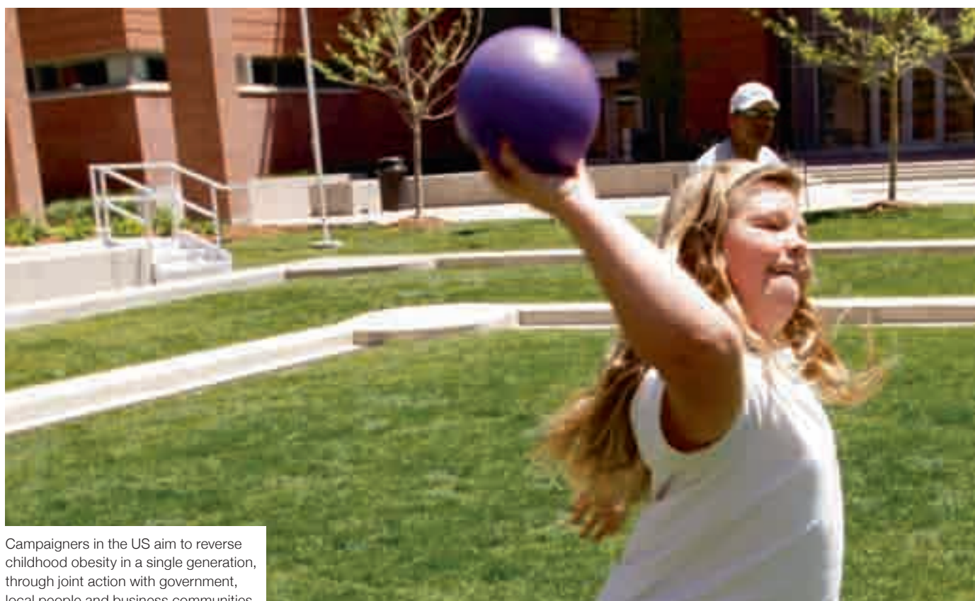
Campaigners in the US aim to reverse childhood obesity in a single generation, through joint action with government, local people and business communities

products and services, technical knowledge and capacity, as well as obligations for social responsibility. Media outlets bring their ability to create awareness and mobilise.