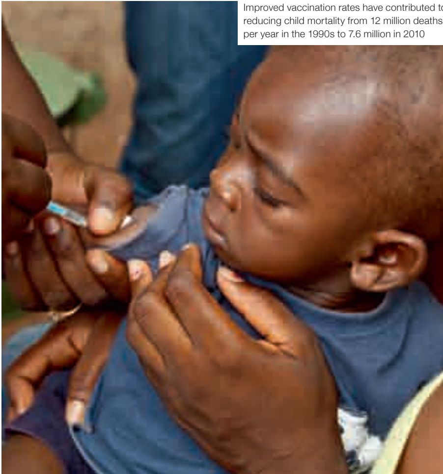
Improved vaccination rates have contributed to reducing child mortality from 12 million deaths per year in the 1990s to 7.6 million in 2010

identify the evidence and develop the language and arguments needed to help decision-makers fully understand the foreign policy implications of global health security.