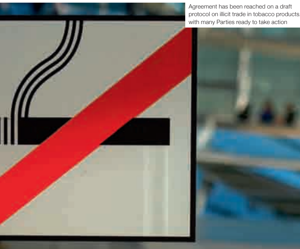
Agreement has been reached on a draft protocol on illicit trade in tobacco products, with many Parties ready to take action

approach in the development of public health instruments. It also provides a new legal dimension to international health cooperation and a model for an effective response to the negative effects of globalisation on health. As such, the Convention has marked a landmark in public health. In a further development of the treaty approach, the Intergovernmental Negotiating Body established by the Conference of the Parties has now reached agreement on a draft protocol on illicit trade in tobacco products. Once adopted by the Conference of the Parties, it would become the first protocol to the FCTC and an international treaty in itself. The portfolio of legally binding instruments in public health may therefore expand, this time under the umbrella of the parent Convention.