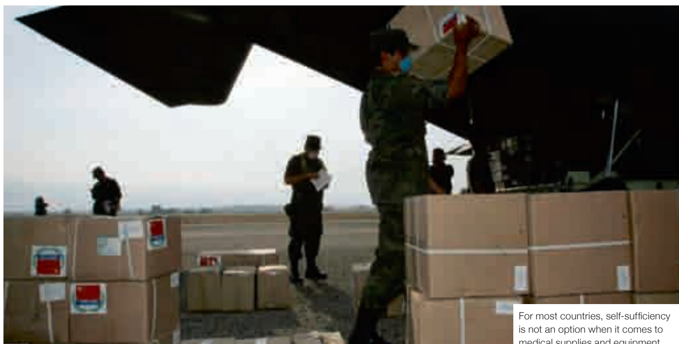
For most countries, self-sufficiency is not an option when it comes to medical supplies and equipment

A decade-long international debate about patents and access to medicines has also highlighted the importance of a vibrant, competitive marketplace. Competition among innovative medicines to treat the same health condition in ever more improved ways drives research and development. Generic competition helps reduce pharmaceutical prices, which is why encouraging competition is part of the policy toolkit of many governments.