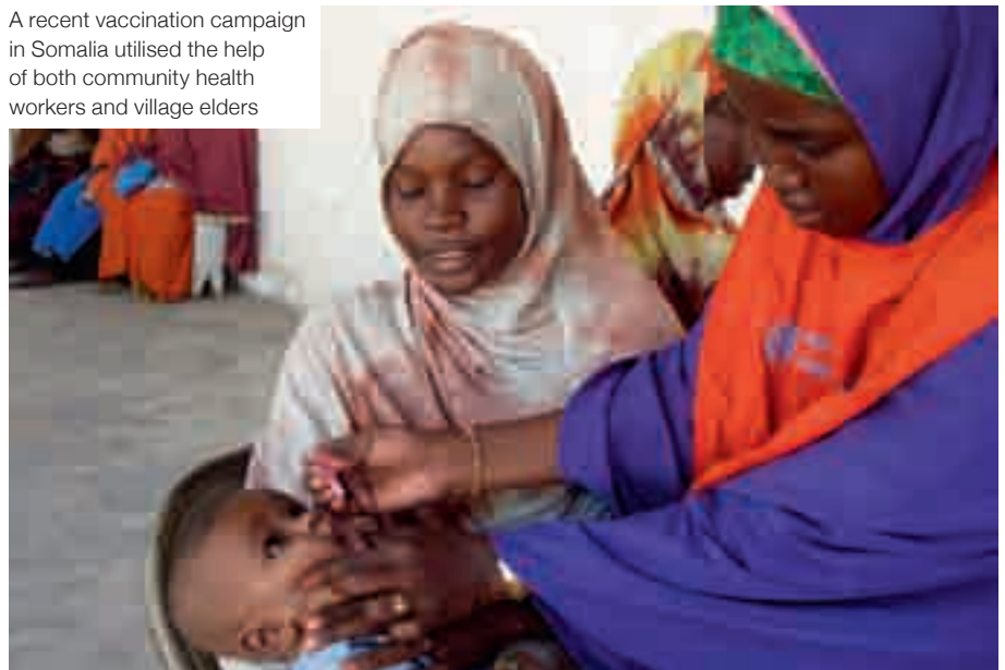
A recent vaccination campaign in Somalia utilised the help of both community health workers and village elders

of key institutions including WHO, UNICEF, the Bill and Melinda Gates Foundation, bilateral aid programmes and multinational corporations.