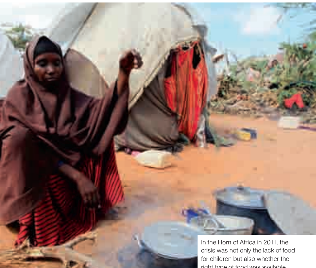
In the Horn of Africa in 2011, the crisis was not only the lack of food for children but also whether the right type of food was available

Achieving this goal is everybody's business. By addressing the root causes of poor health and malnutrition, we can rise to our generation's challenge of providing health, hope and a brighter future to every child in the world. ■