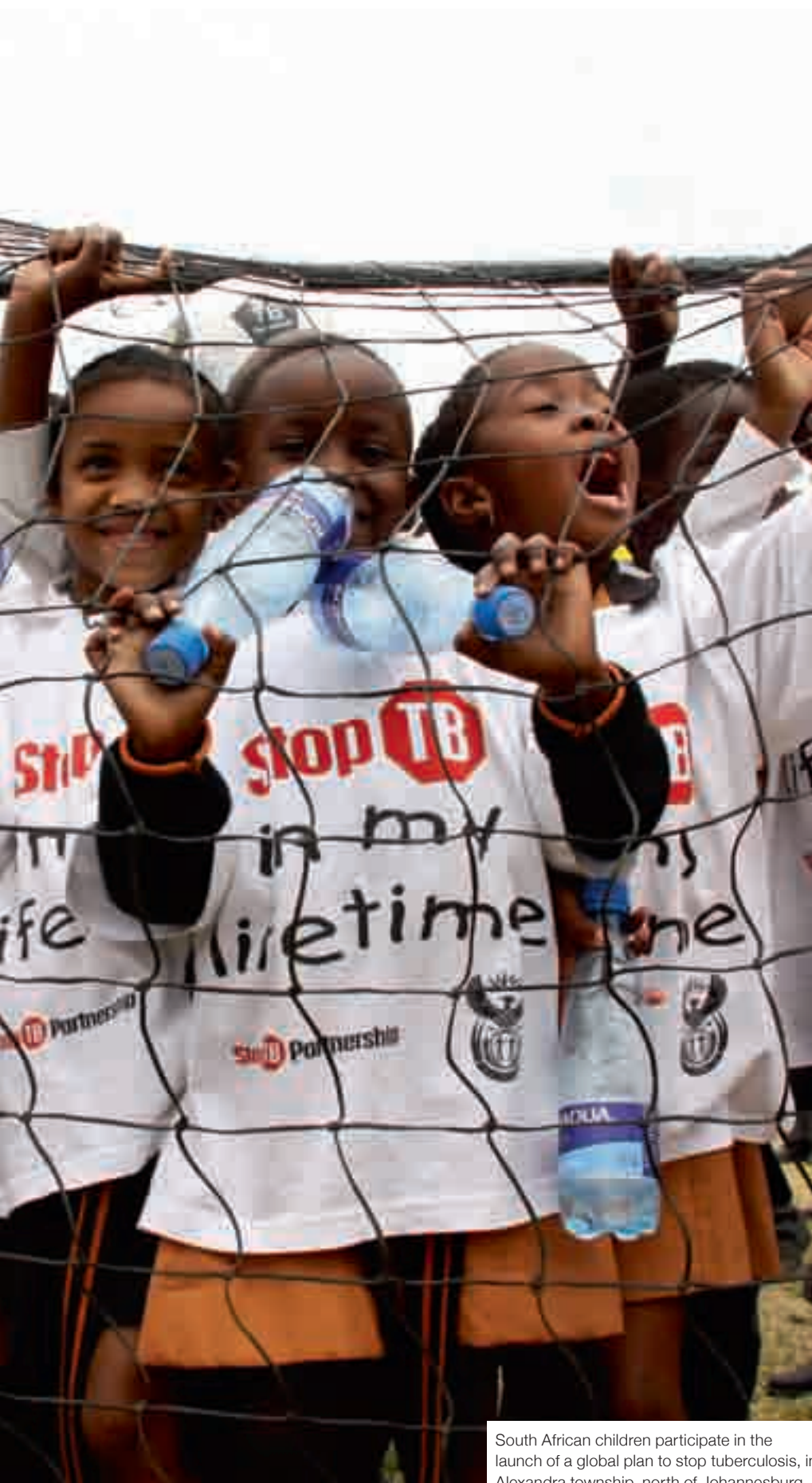
South African children participate in the launch of a global plan to stop tuberculosis, in Alexandra township, north of Johannesburg

and Keeping Their Mothers Alive is mobilising leadership and concerted action among 22 priority countries, with the broad support of donors, technical partners, people living with HIV and the private sector. The prevention of new HIV infections in children can further act as an entry point to advance maternal and child health services, such as identifying high-risk pregnancies; detecting tuberculosis, congenital syphilis and other sexually transmitted infections as well as cervical cancer; and actively engaging men and boys. This focus on impact can shift attention from process to measurable outcomes. Demonstrating returns on investment will garner the attention of finance ministers and the public.