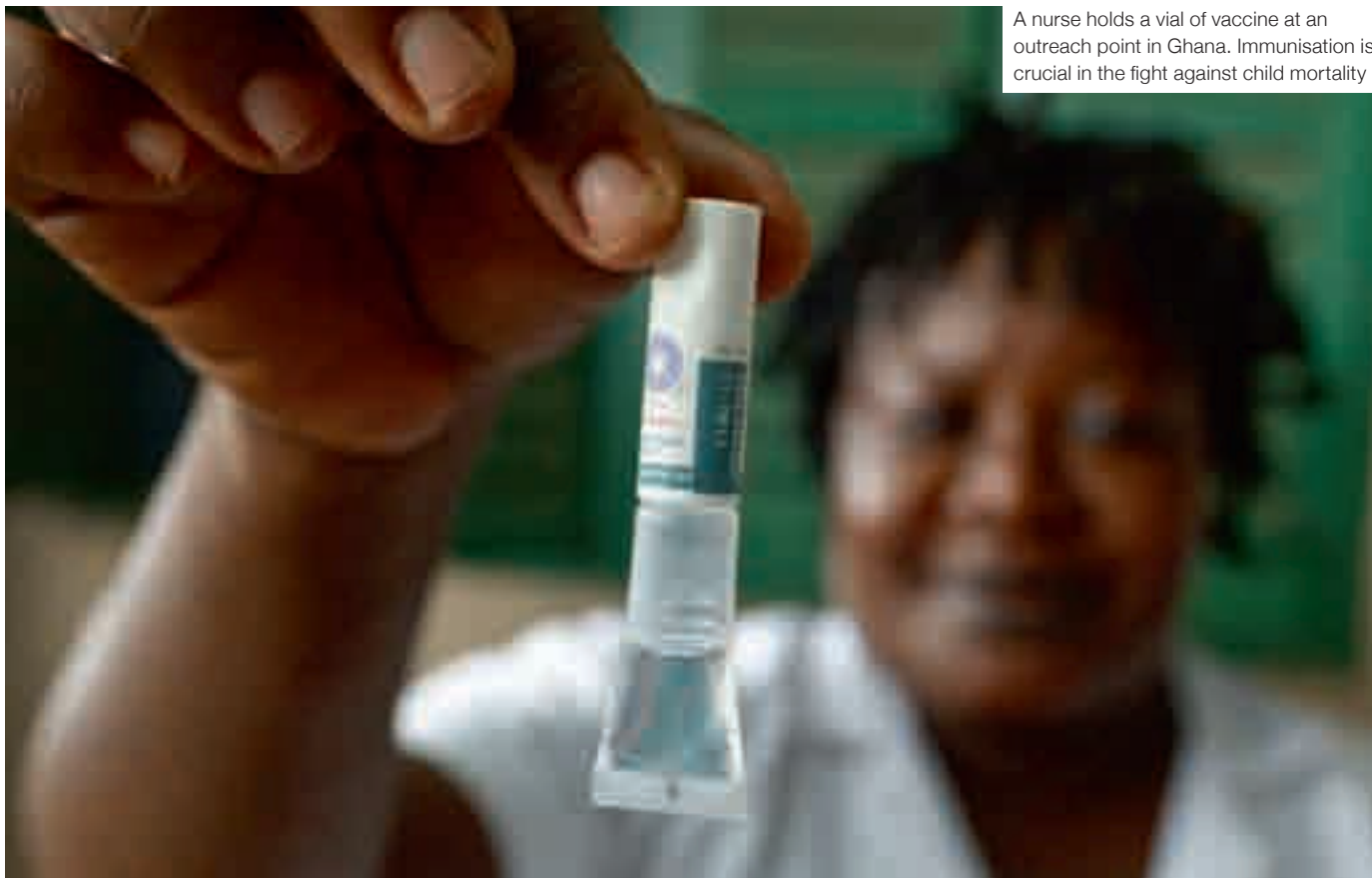
A nurse holds a vial of vaccine at an outreach point in Ghana. Immunisation is crucial in the fight against child mortality

The economics of health in the intensely competitive world of the pharmaceutical industry, set against the need to ensure vaccines and treatments are available to everyone, is at the heart of the debate over access to medicine