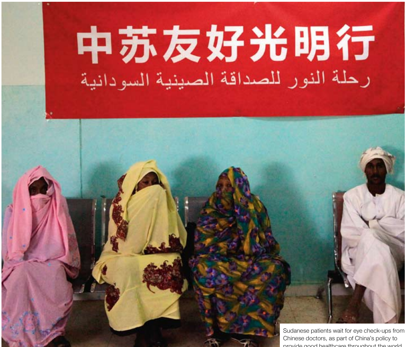
Sudanese patients wait for eye check-ups from Chinese doctors, as part of China's policy to provide good healthcare throughout the world

with health, it is necessary to strengthen communication and coordination and fully mobilise resources. China supports the WHO reform and wishes to see WHO play a leading role in coordinating international public health. China also looks forward to the reform of organisations such as the Global Fund so that a coordinated, highly efficient, transparent and accountable framework for global health governance can be built.