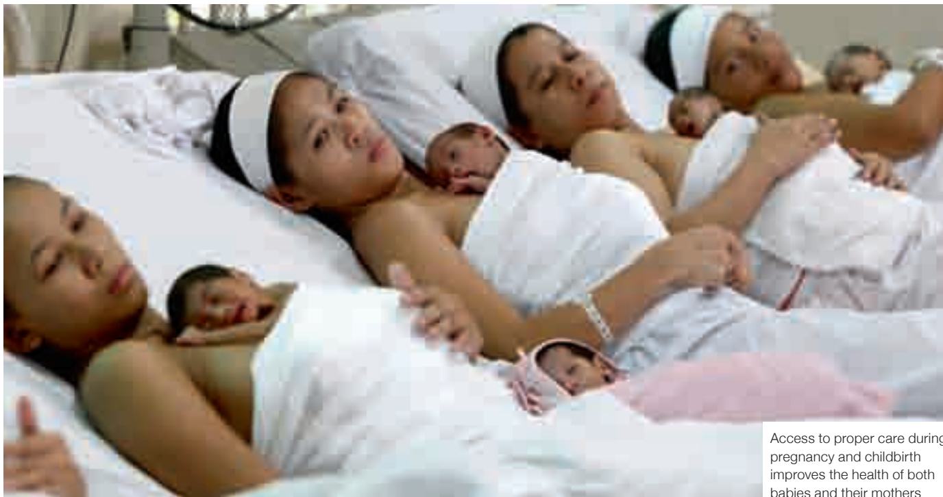
Access to proper care during pregnancy and childbirth improves the health of both babies and their mothers

Women are still dying needlessly in childbirth, but the issue is not just a medical problem, it is the result of multiple unfulfilled human rights that must be tackled as a whole