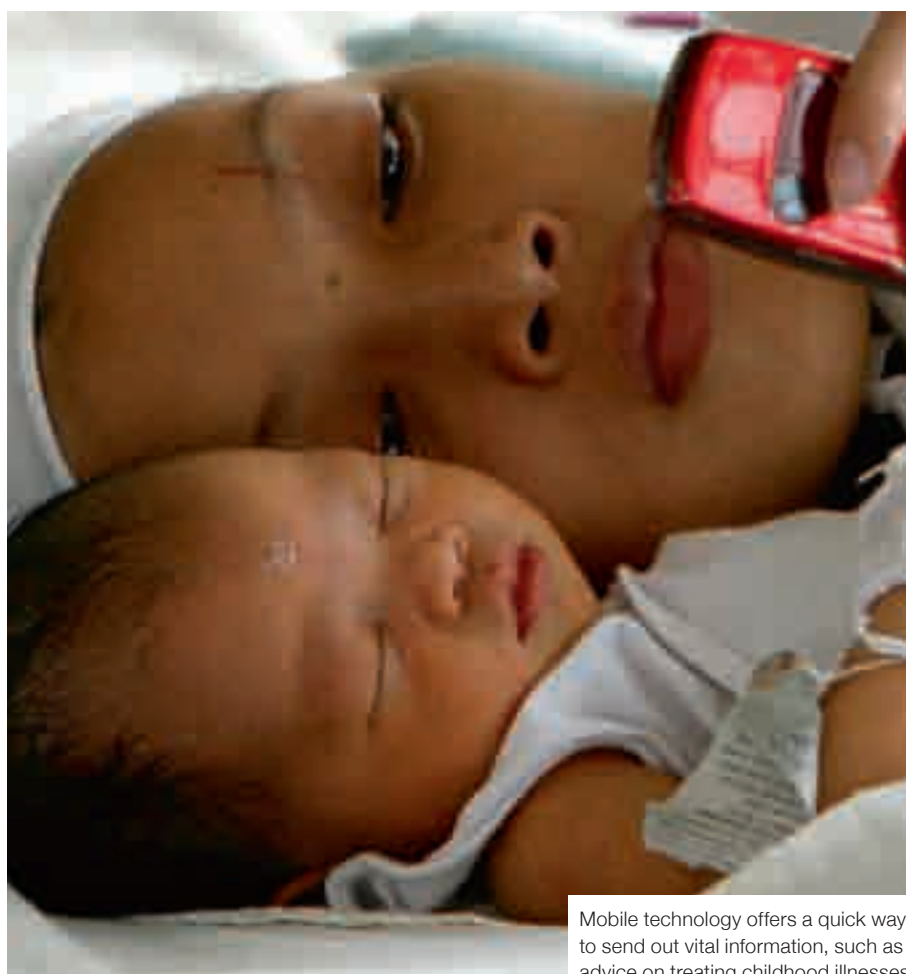
Mobile technology offers a quick way to send out vital information, such as advice on treating childhood illnesses

and effective manner, in contrast to hand-delivering paper reports where lag times can be as long as six months.