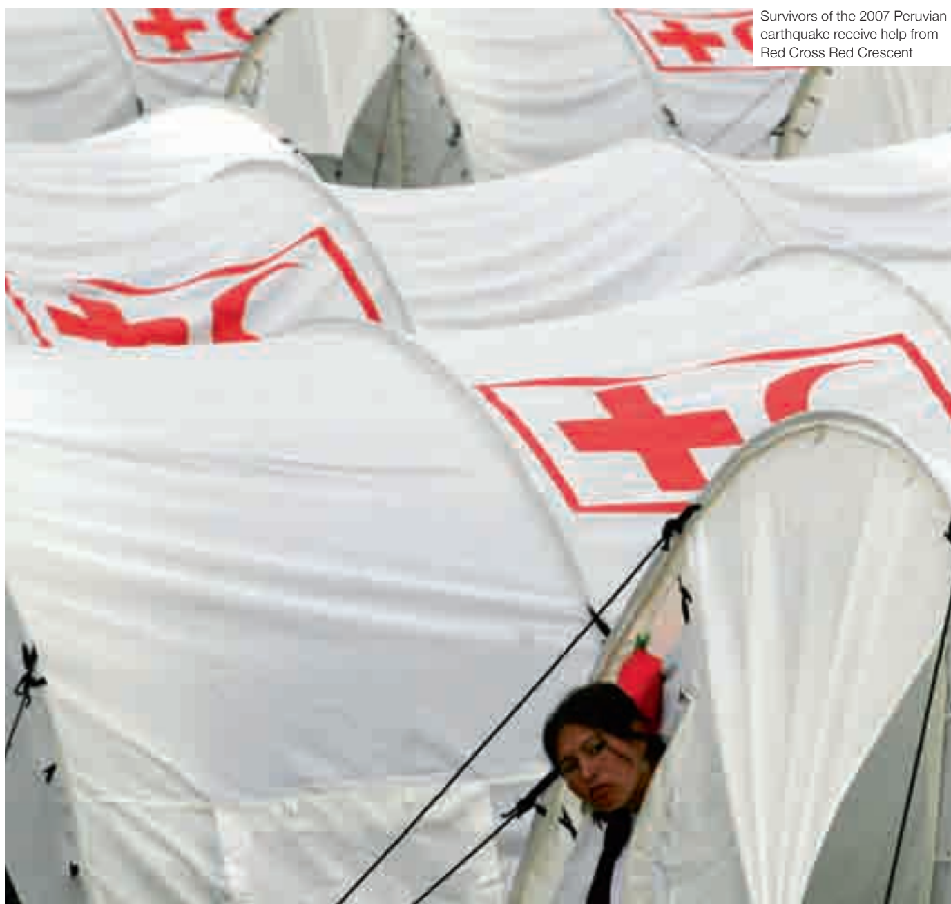
Survivors of the 2007 Peruvian earthquake receive help from Red Cross Red Crescent

unable to prevent communicable and non-communicable diseases while marginalised populations remain excluded from basic health services.