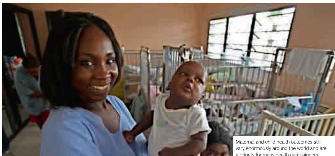
Maternal and child health outcomes still vary enormously around the world and are a priority for many health campaigners

– such as in infectious disease and maternal and child health outcomes – mark much of the world.