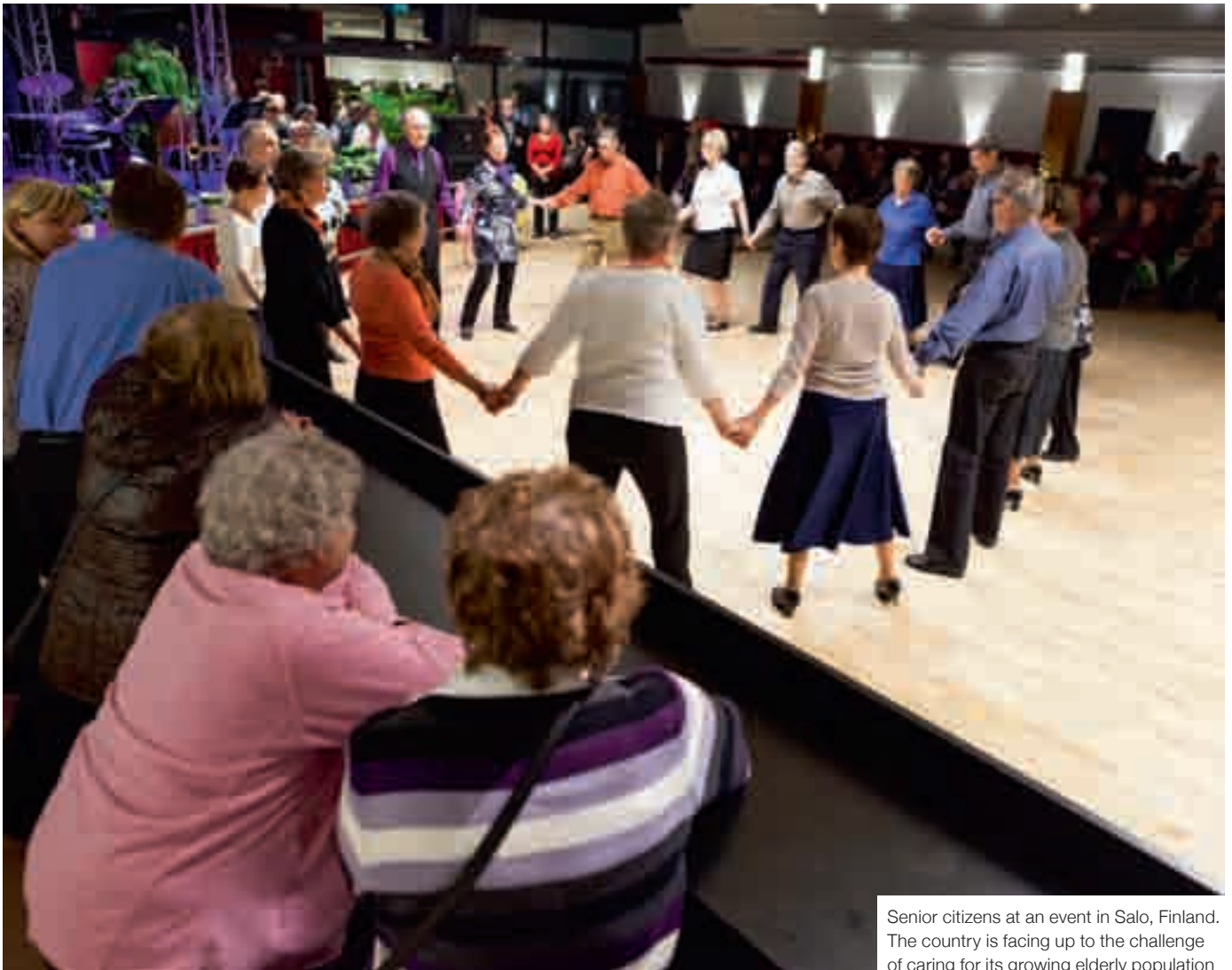
Senior citizens at an event in Salo, Finland. The country is facing up to the challenge of caring for its growing elderly population

equity and fairness. This approach seeks to improve population health and health equity through the determinants of health across sectors.